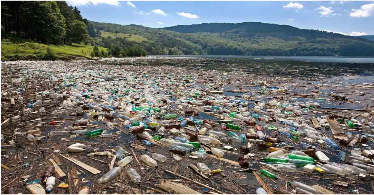
Figure 1: Water pollution

Water pollution is the release of substances into subsurface groundwater or into lakes, streams, rivers, estuaries, and oceans to the point where the substances interfere with beneficial use of the water or with the natural functioning of ecosystems. In addition to the release of substances, such as chemicals or microorganisms, water pollution may also include the release of energy, in the form of radioactivity or heat, into bodies of water. Water pollution (Figure 1) affects plants and organisms living in these bodies of water and in almost all cases the effect is damaging not only to individual species and populations, but also to the natural communities.