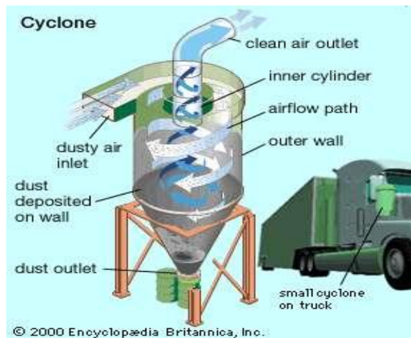
Figure 1: Cyclone

Cyclones are best at removing relatively coarse particulates. They can routinely achieve efficiencies of 90 percent for particles larger than about 20 micrometres ( \mu\text{m} ; 20 millionths of a metre).